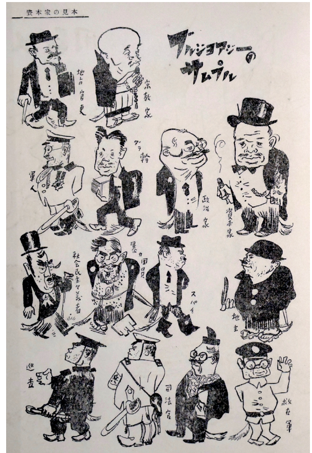
Page excerpt from "The Proletariat Cut-Manga Collection for Battle News (Puroretaria Katto Mangashu)" (1930).