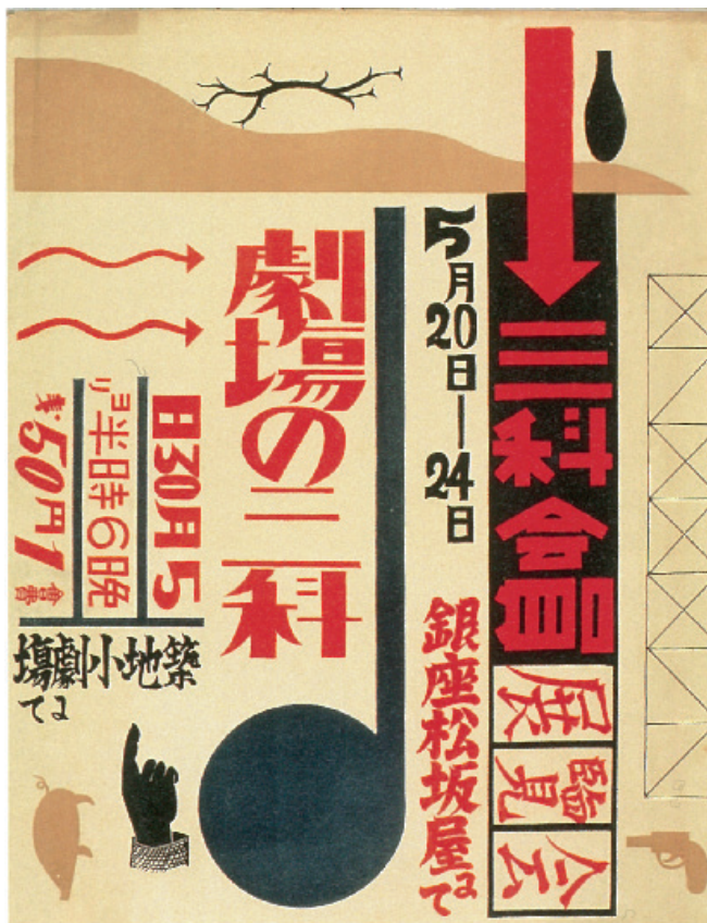
Tomoyoshi Murayama: Sanka Member's Exhibition / Theatre of Sanka (1925). Poster, 51.6 x 33.9 cm.